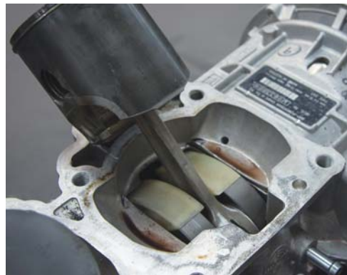
The pistons suffered only minor scuffing.