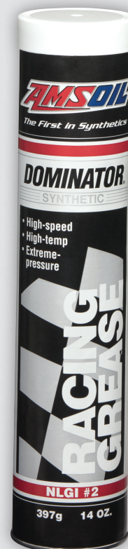
NLGI #2 GC-LB

DOMINATOR Racing Grease contains a robust package of oxidation inhibitors, helping prevent grease breakdown and component surface damage. Its excellent adhesion and cohesion properties allow it to resist water washout during operation in wet conditions. A premium blend of corrosion inhibitors further protects against corrosion formation.