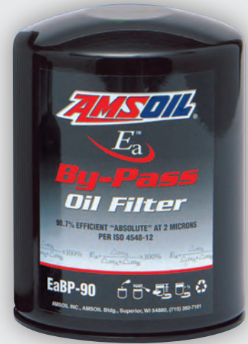
EaBP90 • EaBP100 • EaBP110 • EaBP120

AMSOIL Ea Bypass Oil Filters provide maximum filtration protection against wear and oil contamination. Working in conjunction with the engine's full-flow oil filter, AMSOIL Ea Bypass Filters operate by filtering oil on a "partial-flow" basis. They draw approximately 10 percent of the oil sump's capacity at any one time and trap the extremely small, wear-causing contaminants that full-flow filters can't remove. AMSOIL Ea Bypass Filters typically filter all of the oil in the system several times an hour, so the engine continuously receives analytically clean oil.