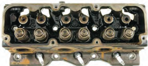
Cylinder head pre-cleanup. Note the sludge deposits on and around the valve springs and push rod openings.