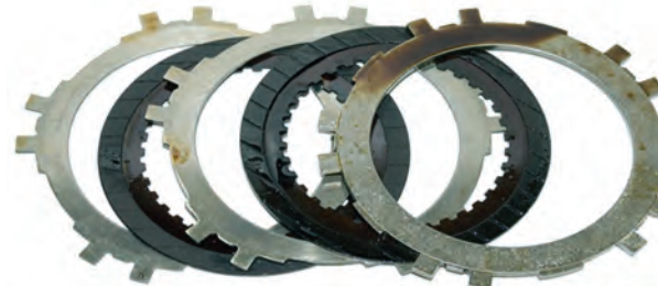
Automatic transmission clutch plates after cleanup with AMSOIL Engine and Transmission Flush reveal lighter glazing and varnish.