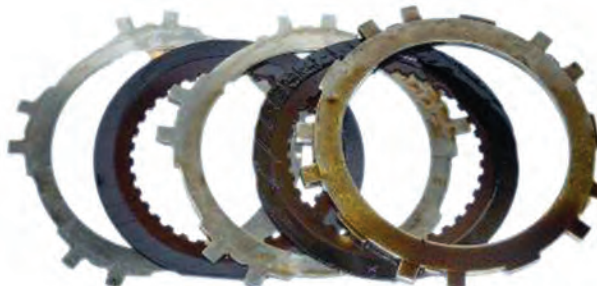
Automatic transmission clutch plates pre-cleanup. Varnish and glazing is heavy on some of the plates.