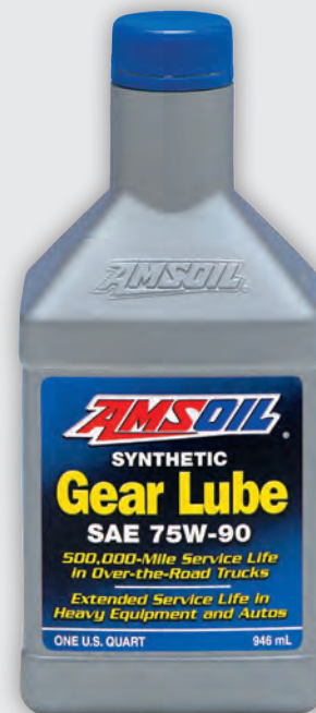
75W-90 (FGR) & 80W-140 (FGO)

Use AMSOIL Long Life Synthetic Gear Lube in differentials, manual transmissions or other gear applications where one or more of the following standards are specified: API GL-5 & MT-1, MIL-PRF-2105E, Dana* SHAES* 234 (Formerly Eaton* PS-037) for 250,000 miles, Dana SHAES 256 (Formerly Eaton PS-163) for 500,000 miles, Dana SHAES 429A, Mack* GO-J & GO-J+, Meritor* 0-76N (75W-90) & 0-80 (80W-140) plus hypoid gear oil specifications from ZF TE-ML 07A and 08 foreign and domestic manufacturers such as GM*, Ford* and Daimler* Chrysler*. It can also be used in rear axles where API Service GL-4 lubricant is recommended.