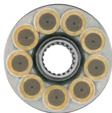
YELLOW METAL PISTON SHOES