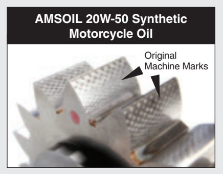
Pass Example: Passed Stage 13, Total Wear, 0mm