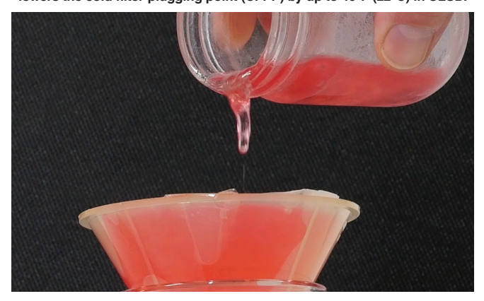
Wax formation in untreated diesel fuel resists pouring.