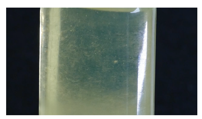
Wax crystals in untreated diesel fuel. The wax crystals will eventually fall out of solution and plug the fuel filter.