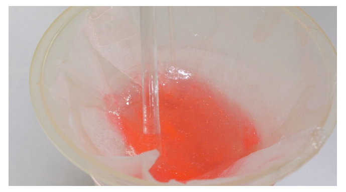
Wax formation in untreated diesel fuel plugs a coffee filter.