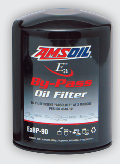
EaBP90 • EaBP100 • EaBP110 • EaBP120

AMSOIL Ea Bypass Oil Filters provide maximum filtration protection against wear and oil contamination. Working in conjunction with the engine's full-flow oil filter, AMSOIL Ea Bypass Filters operate by filtering oil on a "partial-flow" basis. They draw approximately 10 percent of the oil sump's capacity at any one time and trap the extremely small, wear-causing contaminants that full-flow filters can't remove. AMSOIL Ea Bypass Filters typically filter all of the oil in the system several times an hour, so the engine continuously receives analytically clean oil.