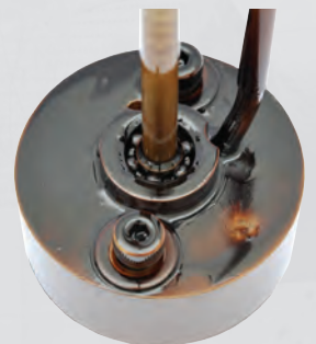
LEADING CONVENTIONAL HYDRAULIC FLUID (ISO 46)