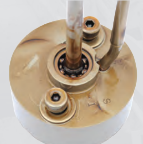
AMSOIL SYNTHETIC MULTI-VISCOSITY HYDRAULIC OIL (ISO 46)

Excessive oxidation results in harmful deposits and varnish that cause a host of problems, including stuck valves and decreased efficiency. In severe oxidation testing, AMSOIL Synthetic Multi-Viscosity Hydraulic Oil resisted elevated heat and oxidation more effectively than the conventional fluid.